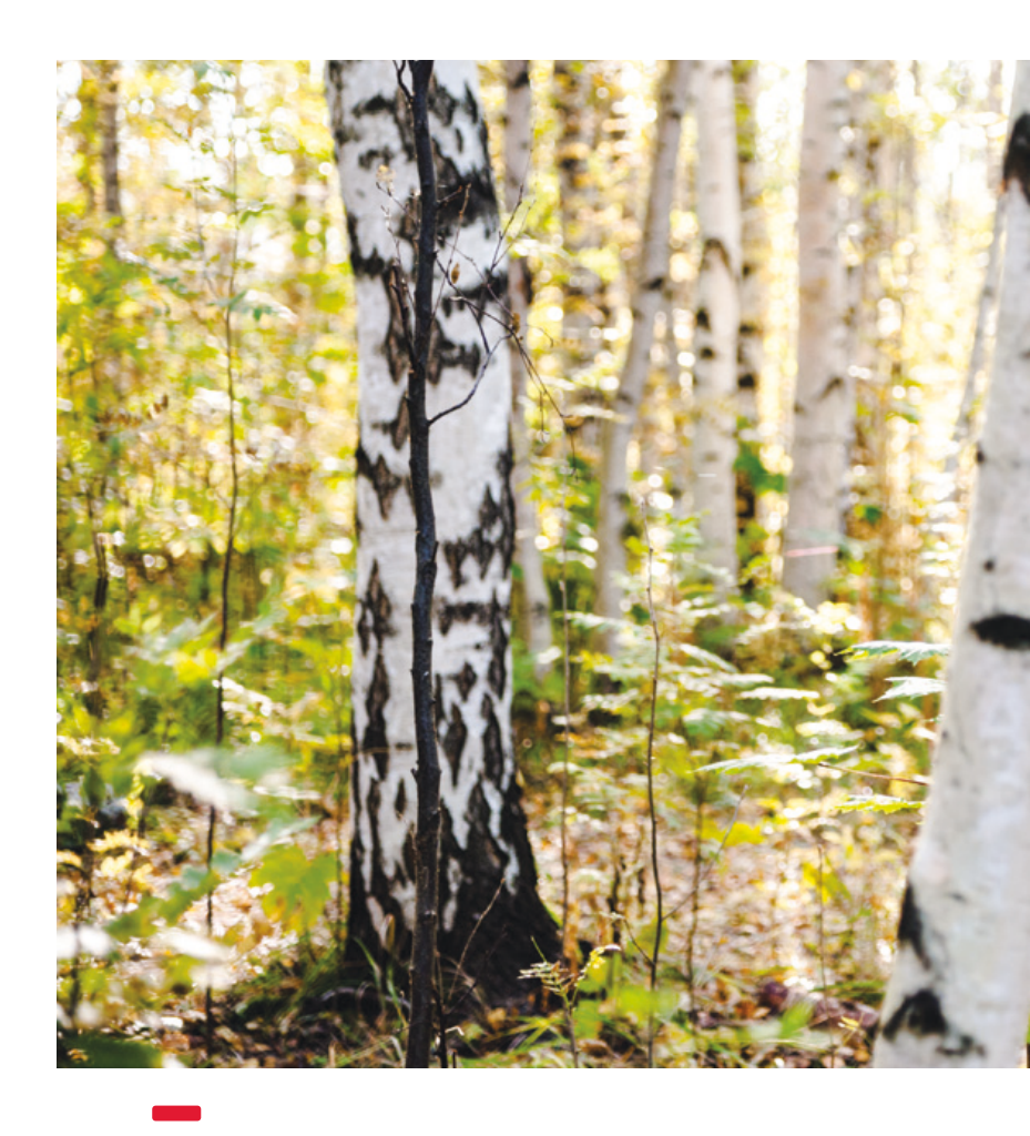
A clean environment is a source for new work and growth.