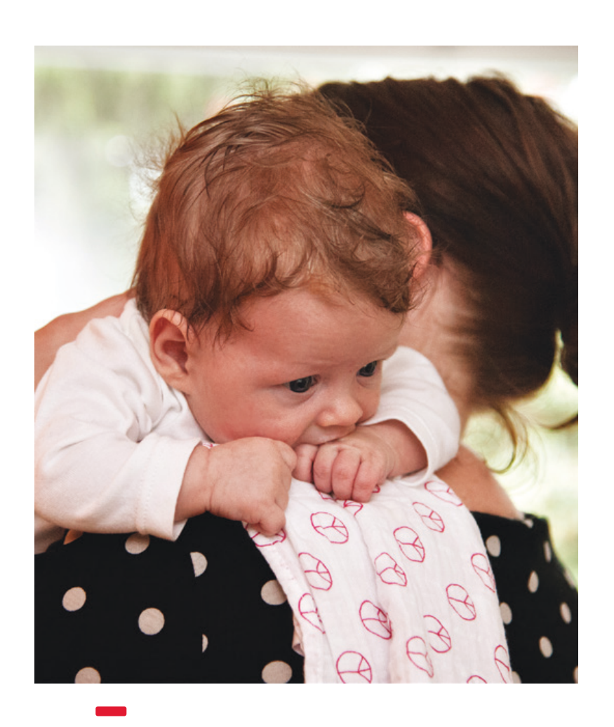
Preventive services, future growth factors or the security of a decent life of people with the lowest income must not be compromised.